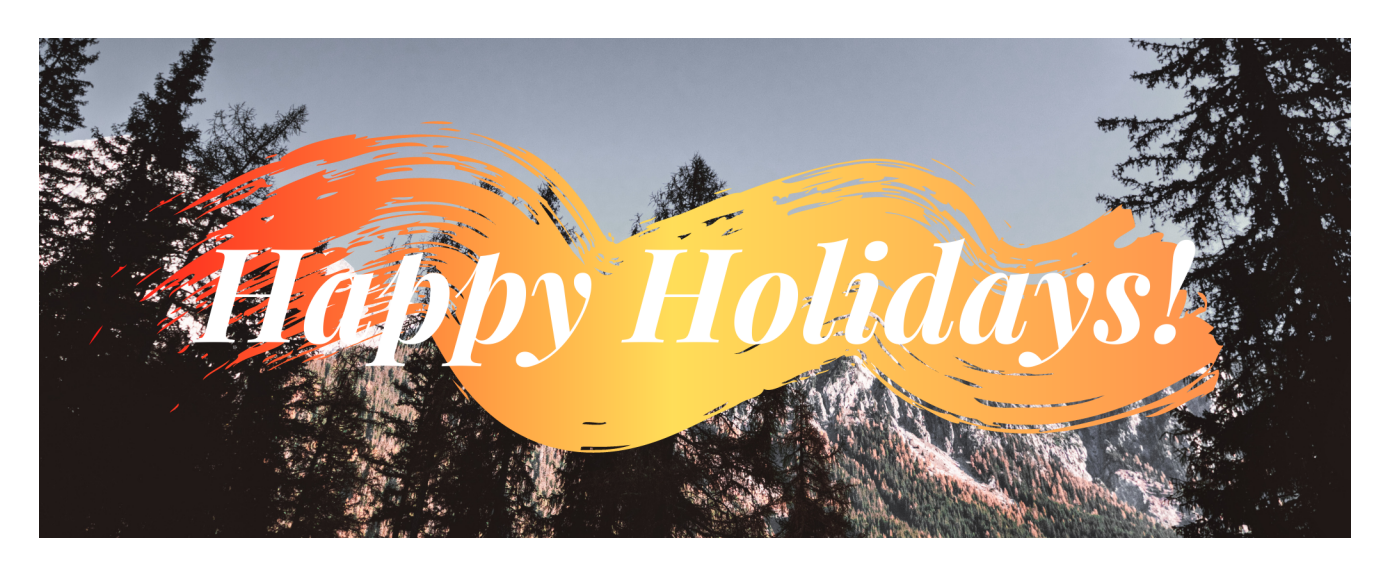
The GTU Dean's Office wishes you a safe & joyful Winter Break! Don't forget, Spring classes begin February 1, 2021