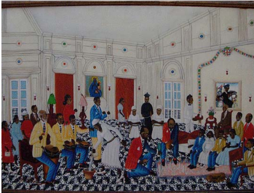
CARE ART FOR LOAN: GERARD VALCIN, VOODOO A LA BOURGEOIS , 1970