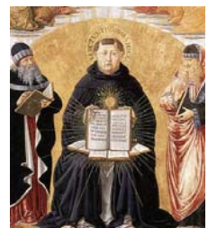
The Triumph of St. Thomas Aquinas, Benozzo Gozzoli, 1471