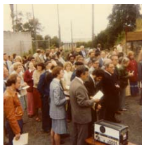
About a hundred members of the GTU community and neighbors gathered for the groundbreaking ceremony. The first phase of the library, the basement and Level 1, was completed in 1981.