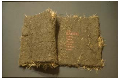
CREATED AND PHOTOGRAPHED BY KAREN SJOHOLM