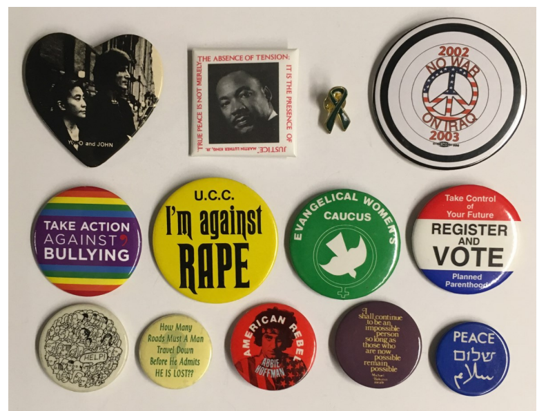
Caption: Political and campaign buttons from the